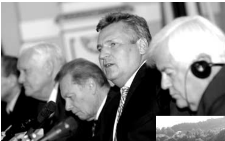
"A Question of Europe's Future", a debated attended by former presidents of Lithuania, Slovakia, Poland and Slovenia