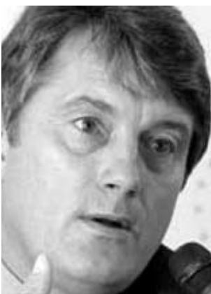
Viktor Yushchenko The President of Ukraine