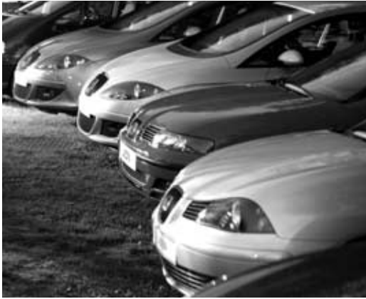
SEAT, the official carrier and a partner of XVI Economic Forum

The Economic Forum in Krynica unfolds as a prestigious event of its kind in Central and Eastern Europe, the main mission of which is development of a favourable atmosphere for the growth of political and economic cooperation among EU Member States and their neighbours. Whilst fulfilling its mission, the Forum remains independent and impartial.