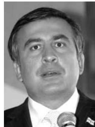
Mikhail Saakashvili The President of Georgia The Man of the Central and Eastern Europe