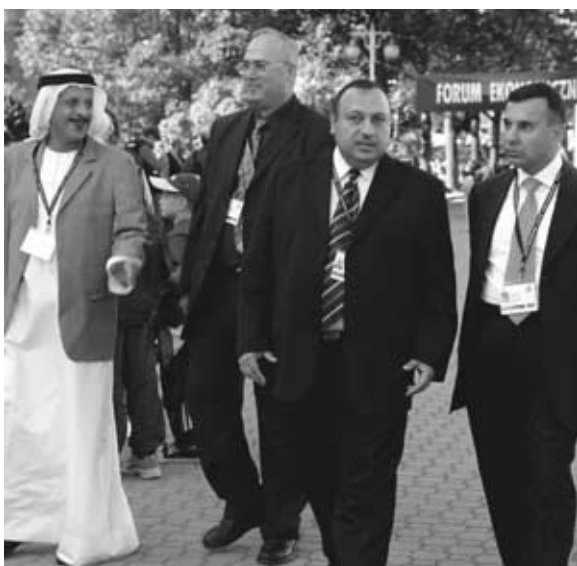
Polish-Arab Day. Representatives of Arab states from Egypt, Iraq, Yemen, Jordan, Kuwait, Morocco, Syria, Tunisia, Saudi Arabia, the United Arab Emirates and the Cooperation Council for the Arab States of the Gulf.

Undoubtedly, Krynica is an extraordinary and unique place. The business contacts do not begin and do not end along with the Economic Forum. I perceive the event as an important element enhancing various forms of presence of Siemens. The sole fact that we want to be there again may be seen as a success by the Forum organizers. I believe this opinion is shared by hundreds of entrepreneurs and companies.