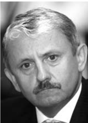
Mikulaš Dzurinda Former Prime Minister of Slovakia The Man of the Central and Eastern Europe