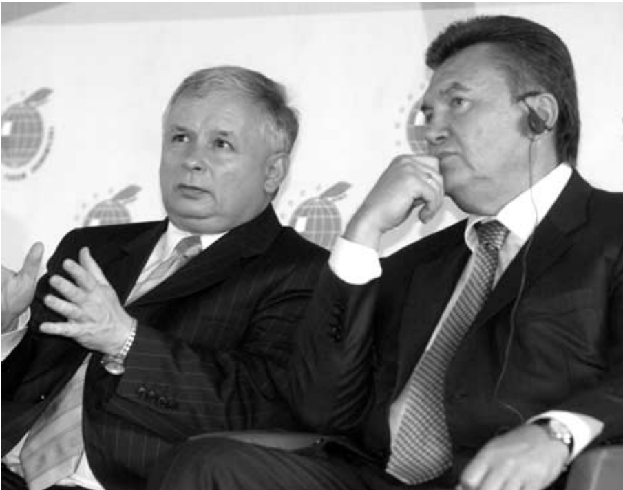
Viktor Yanukovich, Prime Minister of Ukraine and Jarosław Kaczyński, Prime Minister of Poland

The Prime Minister of Ukraine, Viktor Yanukovich announced that "Ukraine is not going to shift the course of policy, set by the former government, with regard to European integration and cooperation with NATO. The reforms are to be implemented with even greater determination. We are convinced that collaboration between the government and the parliament will allow us to enact necessary laws. We are far from Euro-romanticism but instead we focus on Euro-pragmatism. We are going to take decisive actions to transform our country into a real European country. We want to build Europe in Ukraine".