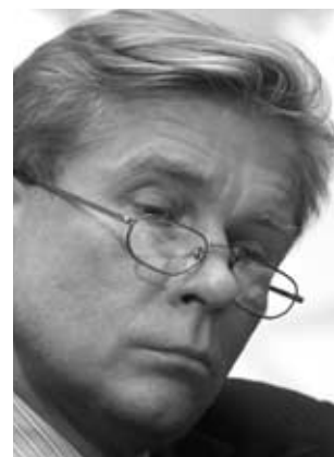
Andronius Ažubalis Deputy Chairman of the Committee for Foreign Affairs of the Parliament of Lithuania