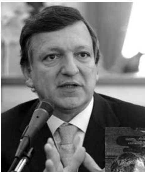
José Manuel Barroso