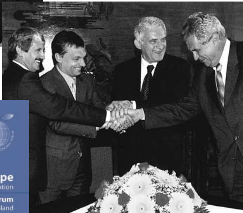
Meeting of Visegrad Group

I appreciate the initiative launched by the Economic Forum, as it allows its attendants an opportunity for a dialogue and discussion, the exchange of opinions we need so much to understand the world we live in, the world that evolves towards growth we had hardly imagined yesterday.