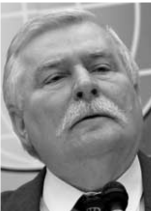
Lech Wałęsa Former President of Poland The Man of the Central and Eastern Europe