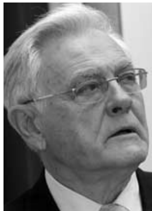
Valdas Adamkus The President of Lithuania The Man of the Central and Eastern Europe