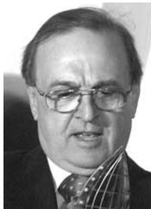
Jiří Gruša A writer and a legend of opposition movement New Culture of New Europe