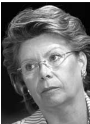
Vivianne Reding EU Commissioner for Information Society and Media

Europe faces a feasible opportunity to compete against the USA, China and India. The main European advantages include established global trends in the area of new technologies and nanotechnology as well as a high quality of life, lack of social unrest and cultural diversification.