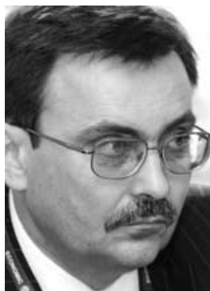
Volodymyr Makucha Minister of Economy of Ukraine