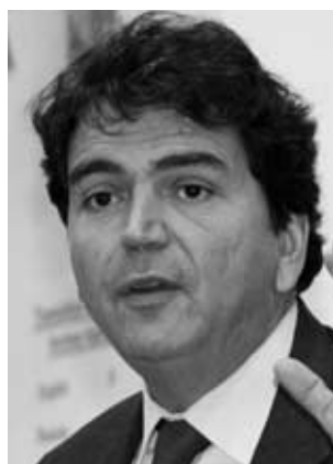
Pierre Lellouche President of the NATO Parliamentary Assembly