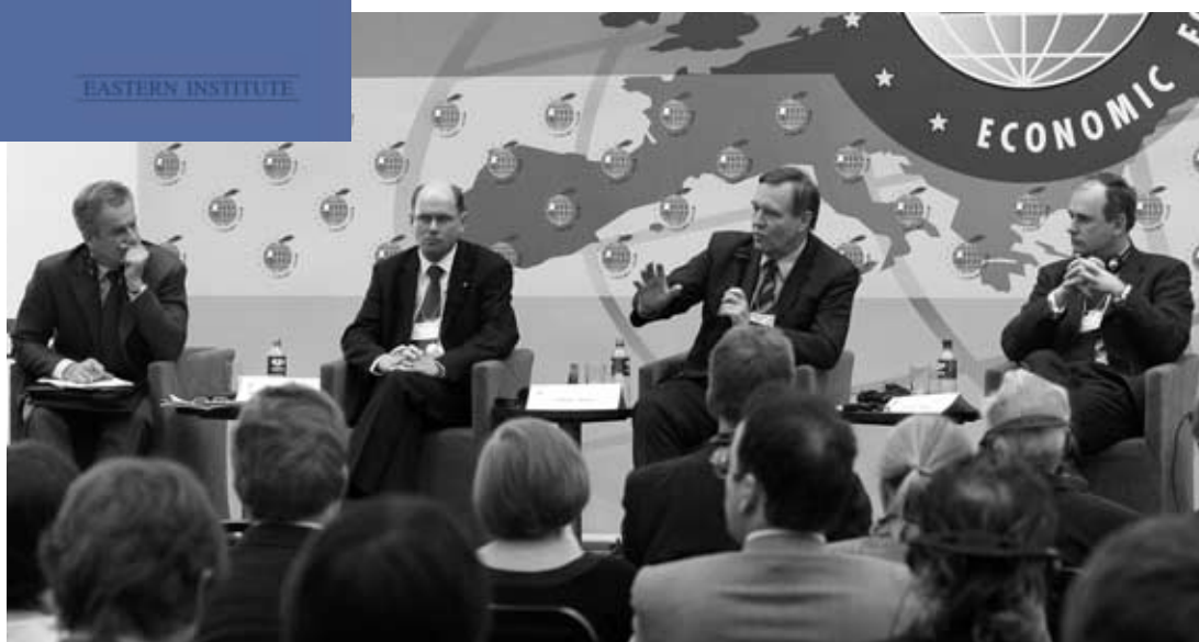
A Plenary Session of II Europe – Russia Forum in Vilnius, attended by Sergey Yastrzhembsky , the Russian President's aide for relations with the EU, Urban Ahlin , chairman of the Swedish Parliament's Foreign Affairs Committee, Volker Rühle , former Minister of Defence of the Federal Republic of Germany, Paweł Zalewski , The Chairman of the Committee of Foreign Affairs of the Sejm (Lower Chamber of the Parliament) of the Republic of Poland.