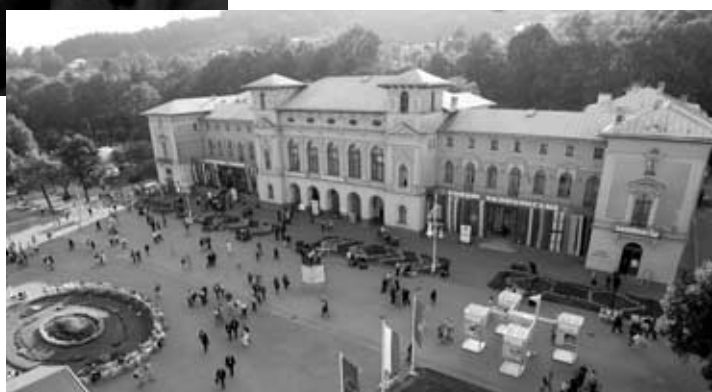
During the Forum, Krynica Spa Promenade is the largest meeting room in Central and Eastern Europe