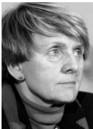
Danuta Hübner EU Commissioner for Regional Policy